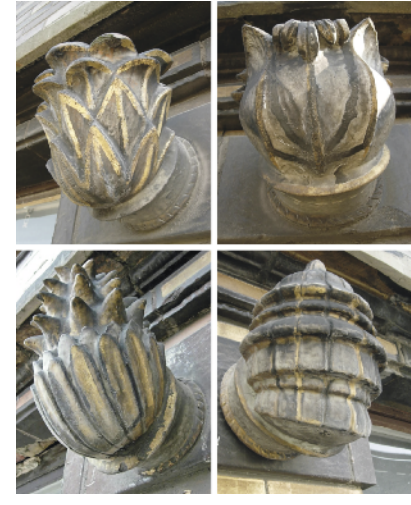
Figure 4. Some ceramic flower finials by Hans Klakow preserved in the facade of the department store. As in 2007 – before renovation.