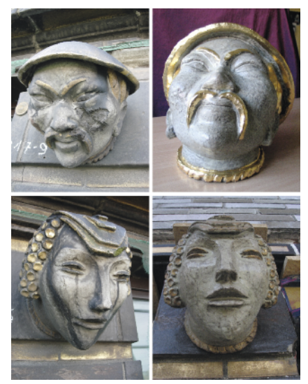
Figure 14. Top: "Chinaman" sculpture removed from the facade and renovated in the laboratory. Bottom: in situ renovated sculpture of a woman.