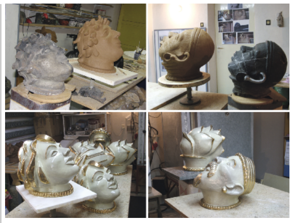
Figure 13. Sculpture replicas by Paulina Pokorny-Ziemba. Subsequent stages from the clay models (top left), through the biscuit burnt models (top right) to the multiplied, burnt and gold plated replicas of heads and finials. As in 2008. Photo by P. Pokorny-Ziemba