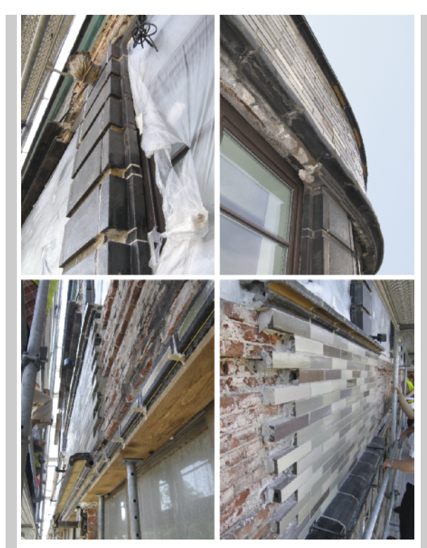
Figure 10. Conservation works at the facade of Renoma department store. Top left: fourth floor pillar finished with a flower finial. Top right: attic wall at the corner of the building with corroded sleepers and cornices. Bottom: renovated fragments of the northern facade. As in 2008.