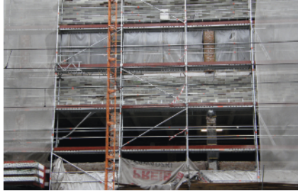
Figure 9. Conservation works at the facade of Renoma department store. Top: best preserved eastern part of the building. Middle left: pillar faced with ceramic tiles and gold plated mosaic. Middle right: renovation of brass display windows and of the backlit grate. Bottom: severely damaged western facade with renovated parapet walls. As in 2008.