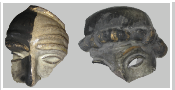
Figure 12. Pieces of sculptures falling off the department store throughout the years. Left: first attempt to clean the sculpture which revealed the original colour of the ceramic ornaments. As in 2007.