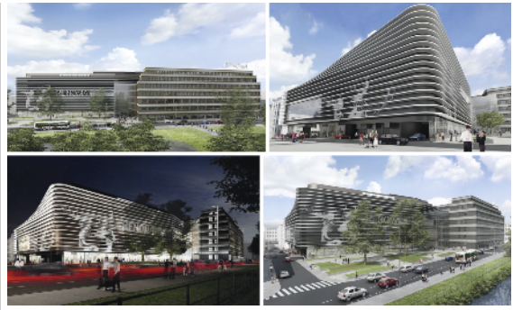
Figure 7. Renovation, reconstruction and expansion concept for Centrum-Renoma department store. Northern and eastern view at the old and new part of the facilities. Design by Maćków Design Studio