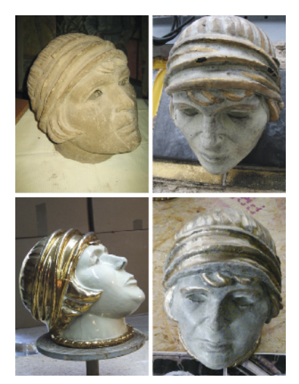
Figure 11. Portrait sculptures showing Hadwig Nitschke. Top left: preserved unburnt clay model made by Urlich Nitschke in 1929. As in 2007. Photo by Y. Bannek. Top right: a sculpture undergoing in situ conservation. As in 2008. Photo by M. Gąsior. Bottom left: head replica made by Paulina Pokorny-Ziemba. As in 2008. Photo by P. Pokorny-Ziemba. Bottom right: a sculpture removed from the facade to undergo laboratory conservation. As in 2008. Photo by Sz. Kucia