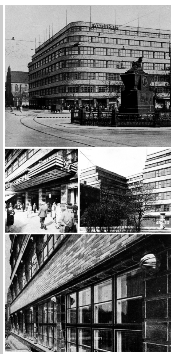
Figure 1. Warenhaus Wertheim soon after the launch in 1930. Top: southern view of the building with Gen. F.B. von Tauentzien's monument in the foreground. Middle left: main entrance from Świdnicka street. Middle right: eastern view of the building. Bottom: part of the western facade with ceramic ornaments and artistic sculptures.

[20] Tomaszewska-Szewczyk A., Przedsiębiorstwo Robót Elewacyjnych i Budowlanych Krzysztof Zawadzki; Program prac konserwatorskich przy elementach metalowych elewacji DTC Renoma we Wrocławiu (Programme of conservation of the facade metal elements of DTC Renoma in Wrocław), Manuscript, Wrocław 2007, (in Polish)