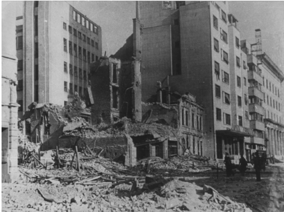
Figure 2. Ruins of downtown Belgrade (1941). German Nazi decided to destroy everything linked with Serbian history and culture (almost all Belgrade's stately buildings were destroyed at the time, but the rest was subsequently demolished in ally's bombings in 1945)

Belgrade aims to strengthen its political leadership to better exploit its strategic position at the hearth of economic traffic and mobility in the South East Europe. Due to its financial means, it attempts to use the large investment which the national government is currently putting into transport infrastructure, such as Corridors 7 (Danube River) and 10 (highway London-Mumbai, via Vienna, Belgrade and Istanbul), the port, the half-ringing road and the completion of underground high-speed train system, as opportunities for urban development as well as challenges against user-led traffic. While Belgrade is hoping to get its urban regeneration