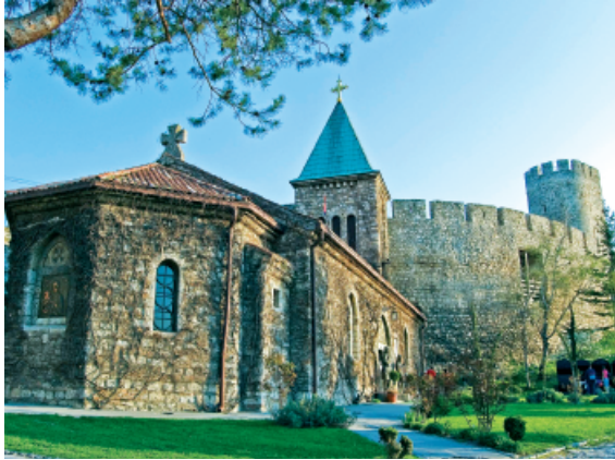
Figure 1. Ružica (Rose) Church in Kalemegdan Fortress, Belgrade. A church of the same name existed on the site in the time of Despot Stefan Lazarević, son of Serbian Commander in famous Kosovo battle, Knez Lazar. It was demolished in 1521 by the invading Ottoman Turks. Today's church was a gunpowder magazine in the 18 th century, and was converted into a military church between 1867 and 1869. Heavily damaged by Austro-Hungarian canons during the First World War, the church was renovated in 1925

Today Belgrade too has to compete hard with other similar cities. The most significant economic sectors in the city are financial services, commerce, the port, light manufacturing and growing tourism. Its cultural