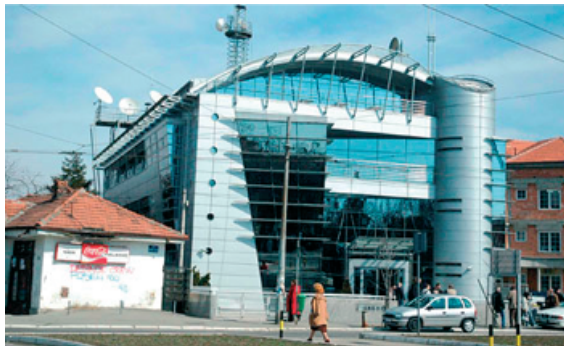
Figure 5. Pink Television Headquarters in Belgrade, at Unknown Soldier Street (designed by architect Aleksandar Spajić, 2001)

Right here, in avoiding of growing need for innovative approaches primarily in the field of urban planning and architecture, specific reasons lay down for the development of Belgrade in waves. This situation has, however, certain advantages too: some of the urban and architectural fashion, like postmodernism, for example, passed but left behind no serious damage. This basic dilemma in Belgrade is clearly expressed especially in recent years, since some substantial reconstructions and revitalizations, but sometimes only “beautification” happened, mainly concentrated in the city center. And now, at the beginning of the third millennium, Belgrade is facing circumstances that provide an opportunity for decisive step, necessary to its future development.