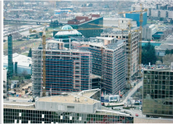
Figure 6. New Belgrade City Centre, West Side of Mihailo Pupin Boulevard. The outlook of a metropolis

Interest of urban planners and politicians is still primarily concentrated in the central parts of the two banks of the Sava. Their adjustment to the demands of tourism is also evident through beautification, urban cosmetics and continuing urban “museology” interventions, but they should actually be on the move much more towards the periphery and needs of modern urban development as a whole. Chances that Belgrade is now facing are based primarily on its geopolitical position, historical experience on its disposal, cultural opportunities, and active political concept of living here and now and also for the future (Keiner, 2005).