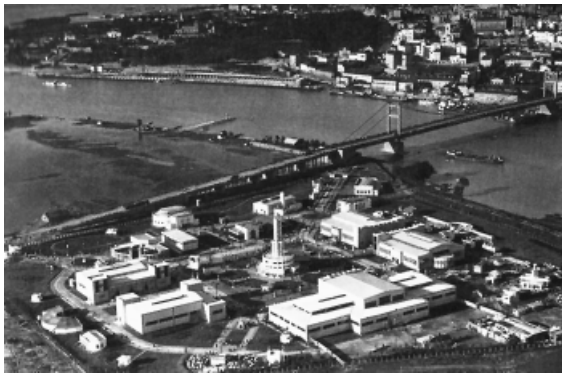
Figure 4. Belgrade's Old Fairground as built in 1938, now in dilapidated condition, should be commemorating the Second World War tragedy as German and Croatian fascists' Concentration Camp where thousands of Serbs, Jews and Roma were brutally killed

enclosing on almost full three sides (west, south and east) already densely built urban area, just as at the same time happened in many other European cities. North, Trans Danube Belgrade, remained to wait and here is the opportunity to welcome it. There is certainly a great need for a future ultra-modern sustainable Trans Danube Belgrade, and commercial indicators could be easily justified for rapid and more valuable development. In that case the Great War Island, as future large park and recreational area for the entire metropolis, remains at the heart of Belgrade.