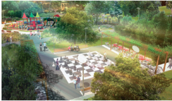
Figure 9. Tašmajdan (Stone Quarry) Park in Belgrade, founded in 1958, covers an area of 11 ha. It was recently reconstructed by Azerbaijani and Serbian Government. Today appreciated as an excellent outdoor recreation public space, frequently visited by Central Belgrade inhabitants

One of the key priorities of our globalised world is to build and transform our cities in a coherent way (Williams, 2000). Citizens are also convinced of the important role and great responsibility that city leaders and urbanists around the world must assume. There is a growing need for creative urban management and leadership, and a platform for cooperation between city leaders and urbanists to share their own experiences in building and transforming their cities. Planners are not alone in this endeavor, and they need to cooperate with city and state administrators. Of great importance for planners is the dialogue and cooperation with elected members and in particular the mayors of cities who alone can guarantee the legitimacy of planning decisions.