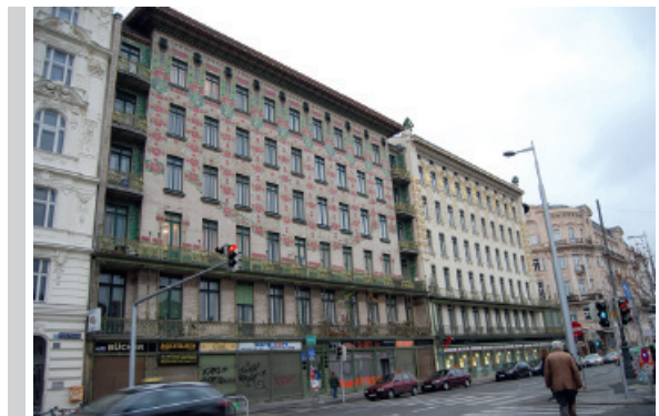
Figure 7. Otto Wagner; Houses, Linke Wienzeile 38-40 and Köstlergasse 2, Vienna, (current view).

styles are the best to be seen on the street frontage including the Majolikahaus combined with the facade of the neighbouring building. (Fig. 8) Otto Wagner ’s building is a triumph of the utility over hypertrophic form.