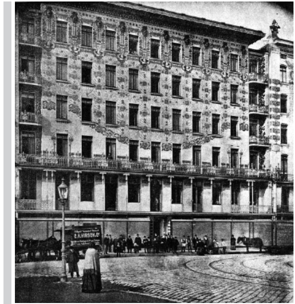
Figure 6. Otto Wagner; Majolikahaus, Linke Wienzeile 38, Vienna, 1900. Allgemeine Bauzeitung, Jahrgang 65, Verlag von R. v. Waldheim, Vienna, 1900, III.11

The formal differences between the two attitudes and