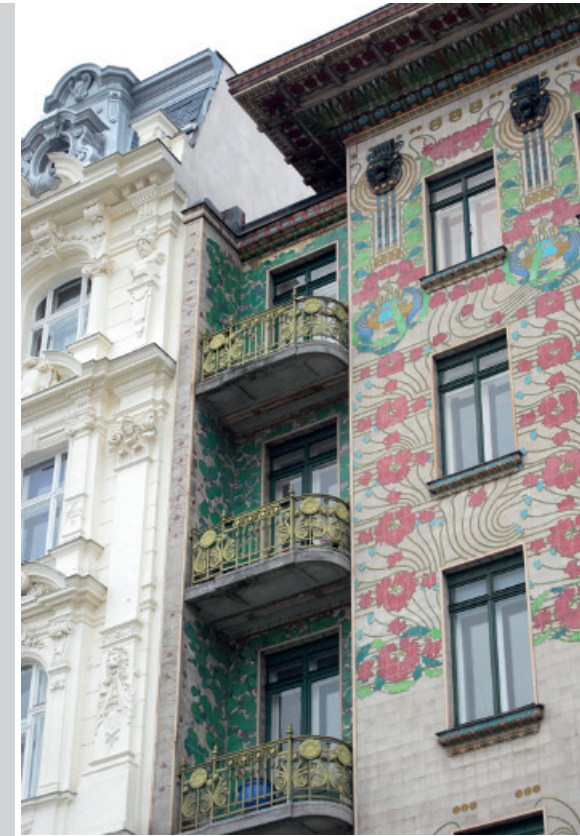
Figure 8. Otto Wagner; Detail, Majolikahaus, Linke Wienzeile 38, Vienna, (current view).