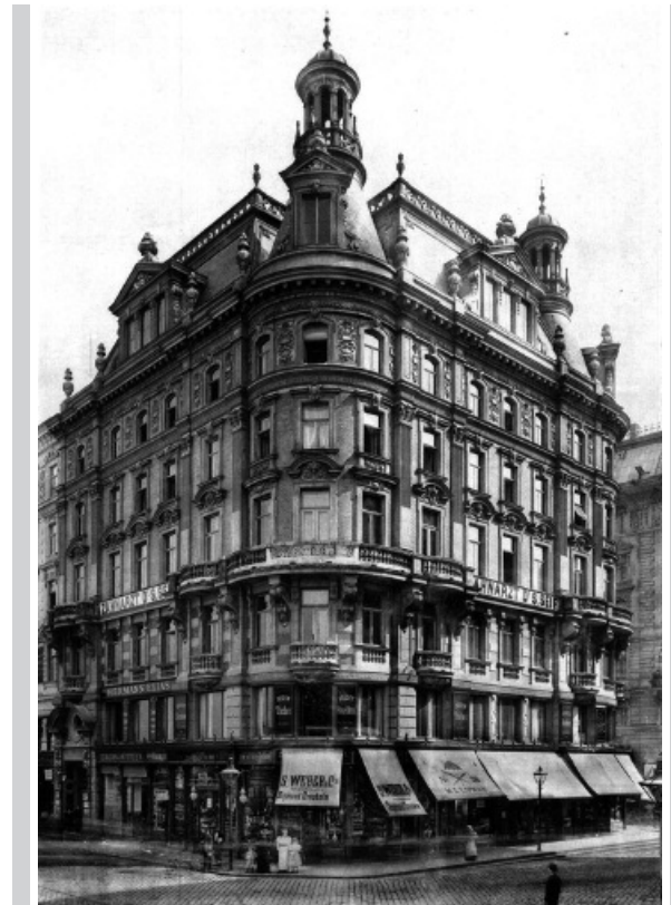
Figure 4. Carl König; „Rothenthurm-Hof”, Vienna, 1890, (does not exist). Wiener Bauindustrie-Zeitung, Wiener Bauten-Album, Jahrgang 12, Vienna, 1895, III.77

model to believe and to imitate. We are mature for its critical review and comparison by which we recognize the constants and regularities in the infinite change of appearance” [16]. König’s expression can be read as the theory, that the history of architecture should help in finding invariant rules independent of passing periods. However, history cannot serve at the same time as a specific template and a source of uncritically taken solutions. Carl König was a supporter of minor changes in time, taking into account the historical achievements of the past. One can specify his views as “evolutionary”, referring to the historical conditions and an attribute of the conservative stance. This attitude towards design is reflected in his built architecture. Some of the sites like Viennese houses “Philipp-Hof” [17] (Fig. 3) on the corner of Augustinerstraße and Führichgasse 5 and “Rothenthurm-Hof” [18] (Fig. 4) on Franz-Josefs-Kai 21 and Rothenthurmstraße 26 unfortunately no longer exist.