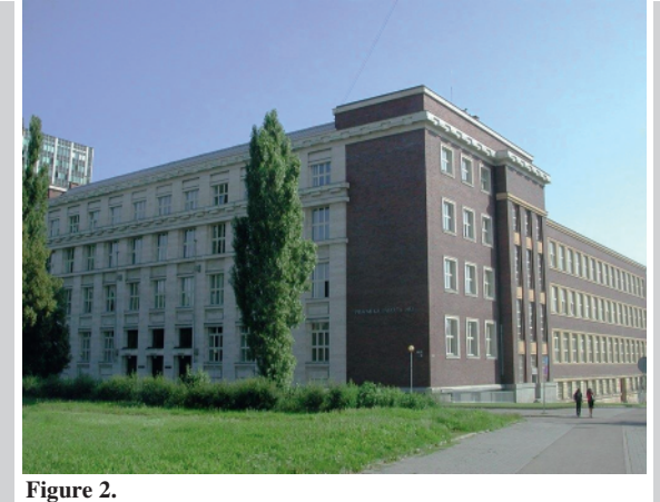
Faculty of Law (building from 1932)

The first building of Brno University of technology (now Faculty of Civil Engineering) built up in 1907